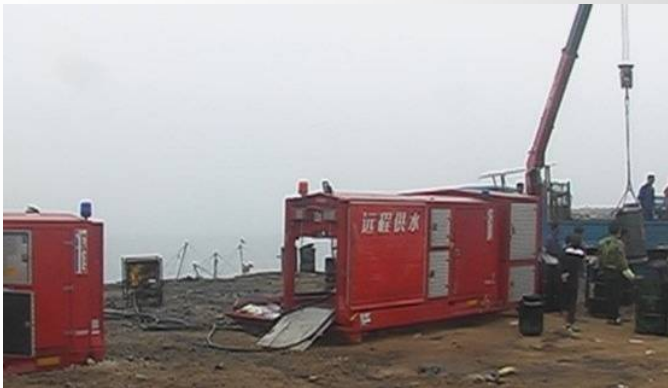
Fire at PetroChina, Dalian PR China 2010