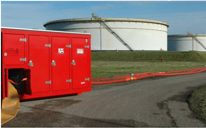
Assistance broken floating roof, BP Amsterdam 2005