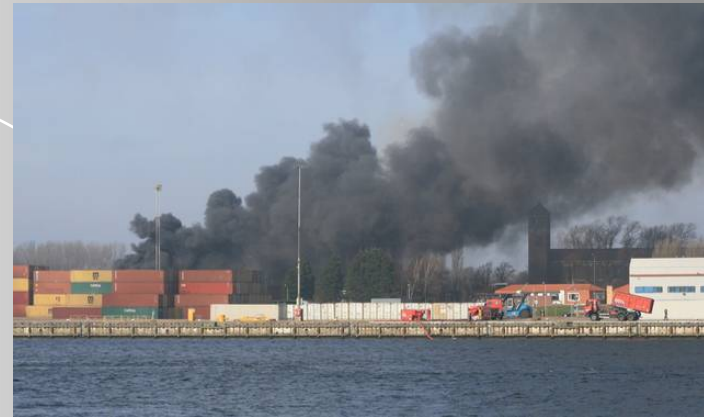
Fire at Recycling company, Velsen NL 2012