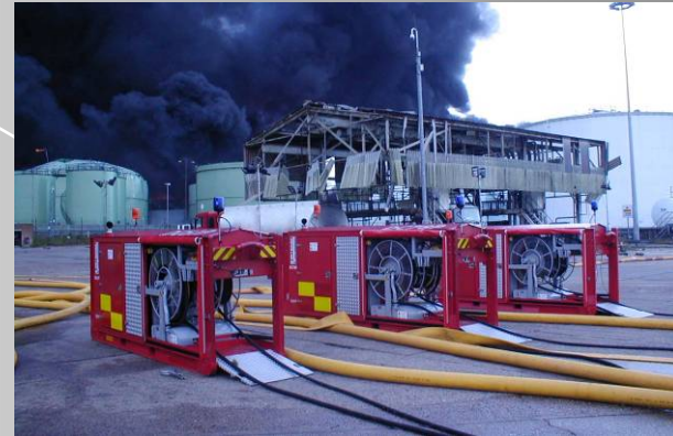
Buncefield Refinery, United Kingdom 2006