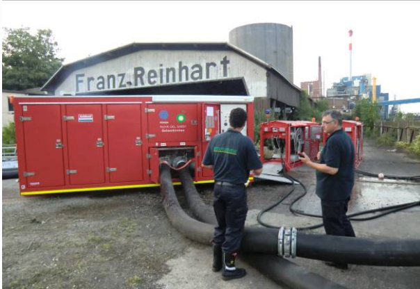
Fire at Karton Recycling, Neuss Germany 2010