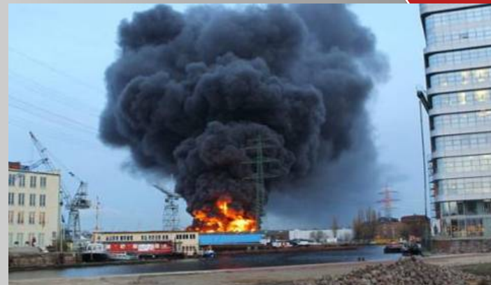
Fire at rubber factory Hamburg Germany 2010