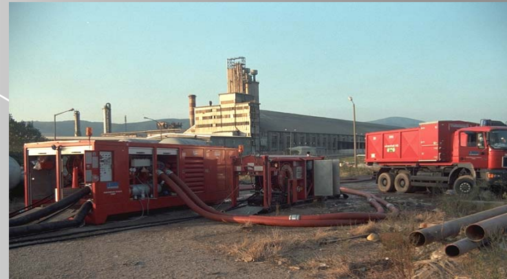
Tank Fire Izmit, Turkey 1999