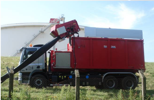
Preventing Fire in a crude oil tank Statoil, Denmark 2007