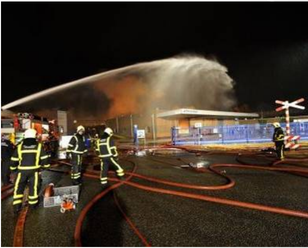
Fire at ChemiePack Moerdijk NL 2011