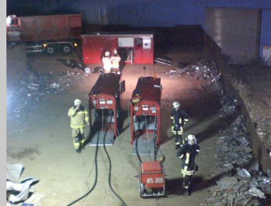
Fire at scrap handling port Duisburg, Germany 2010