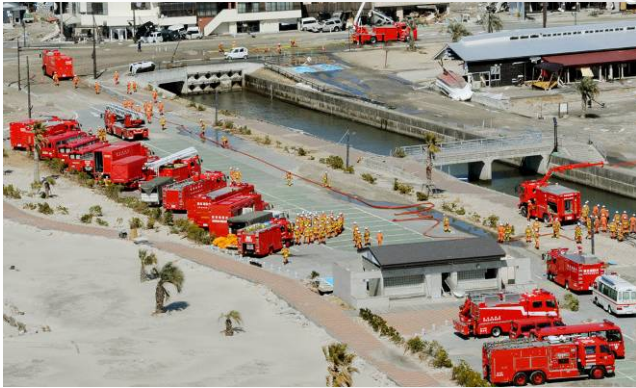
Cooling Fukushima Reactor, Japan 2010