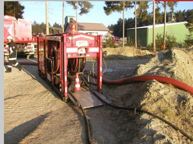
Industriepark Münchsmünster, Germany 2005