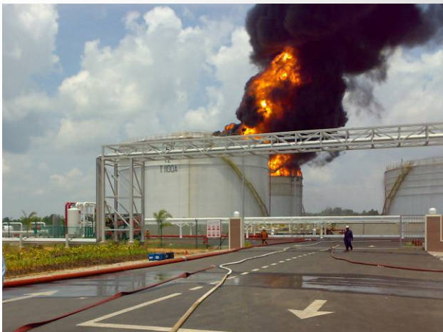
Johor bahru refinery, Malaysia 2007